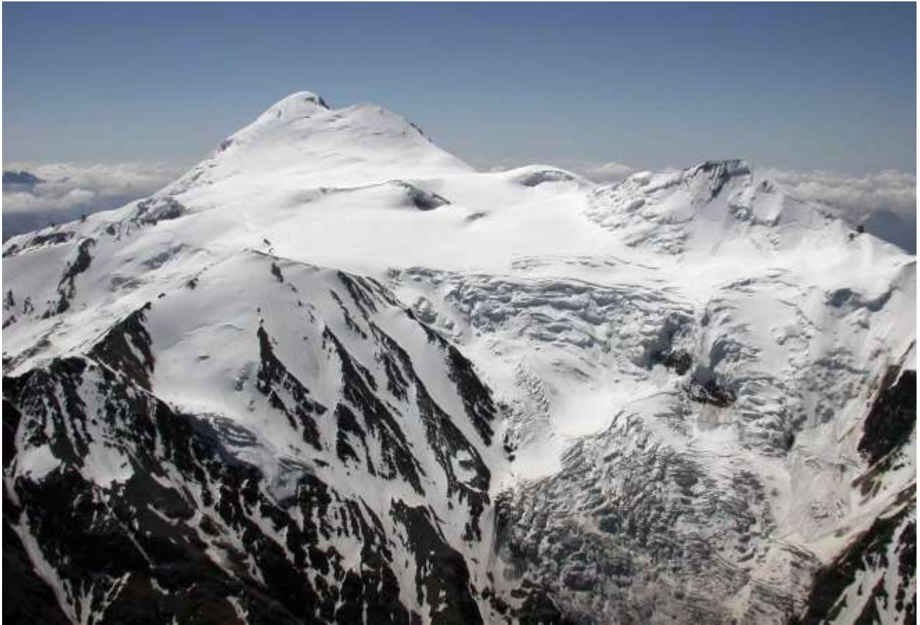
View of Maily glacier and North face Mt.Kazbek

Day 4. Sunrise viewed from the refuge provides breathtaking panorama of the Caucasus. This is the day for acclimatization. Usually, in good weather conditions, we prefer to do skitour to Mount Ortsveri, 4365m. grade 2. It is a good preparation before attempting Kazbek. We go to the west and gain altitude up to 4000metres, where from we climb snow and icy north-east slopes to the summit, 4-5 hrs. Return to the refuge.