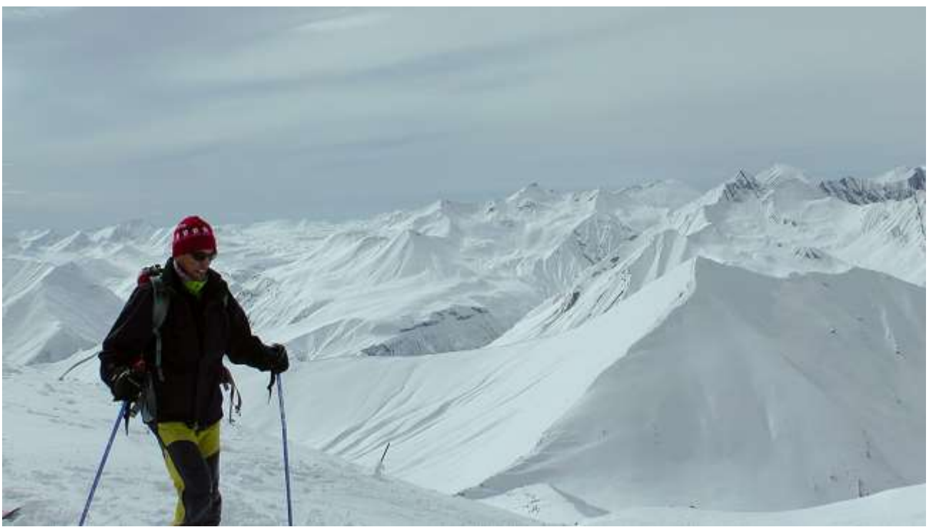
Skitour in Gudauri

Day 2. Today we cross the Jvari Pass (2380m) to a small town of Kazbegi and then village Gergeti (1750m. 4hrs driving). Accommodation in local hostel 3-4 bed rooms. BLD