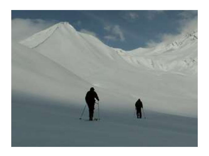
Day 3 Split food and common equipment. Skitour to mountain hut Betlemi (former meteorological station at 3675m, 3-4hrs walking from the campsite). One will not expect much comfort in this high mountain hut, but we try our best. BLbD