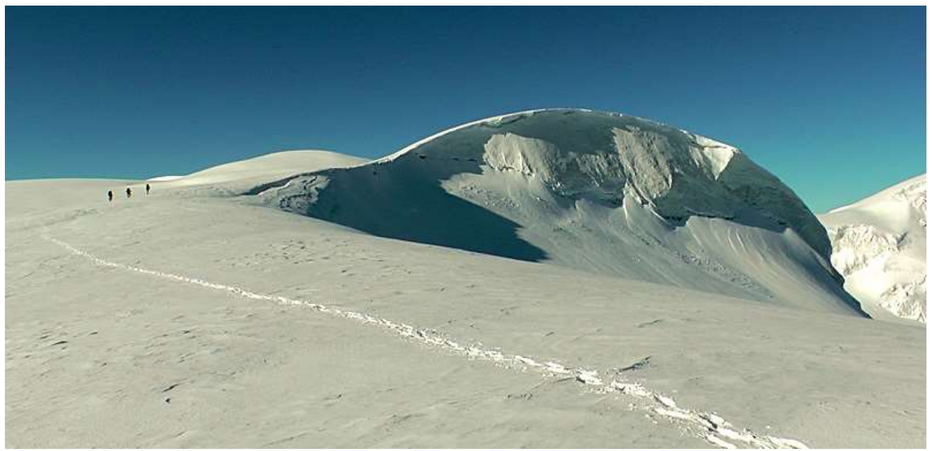
At the top of Maily pass 4400m

Day 5. The Summit Day. From the Betlemi hut a gently rising traverse W leads back to N side of the Ortsveri glacier. Now follow the glacier generally NW for 4km, passing under the S side of the mountain, to attain a large snow Maili Plateau at 4500m on the NW side of the summit area (3h); this section is easy if amply snow covered, but later in the day or late in the season great care must be taken as there are many crevasses in the glacier. Now a steeper slope leads to a small saddle on W side of the summit (4900m, 2h). Snow, rocks and easy angled ice (35 to 40 degrees) lead to the top; possibly 4 rope lengths of difficulty - max. PD sup, grade II+ (from Betlemi hut, about 7h). Return to the refuge, 4hrs.