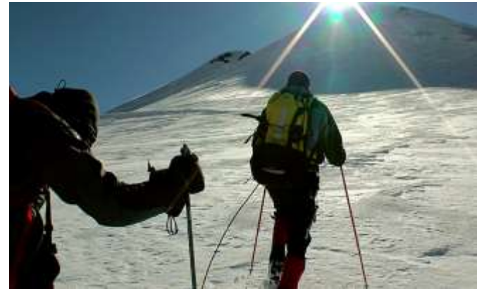
Under Kazbek slope

Day 6. After breakfast we ski down to Kazbegi, 4hrs (Optionally: spare day to attempt climb Kazbek).